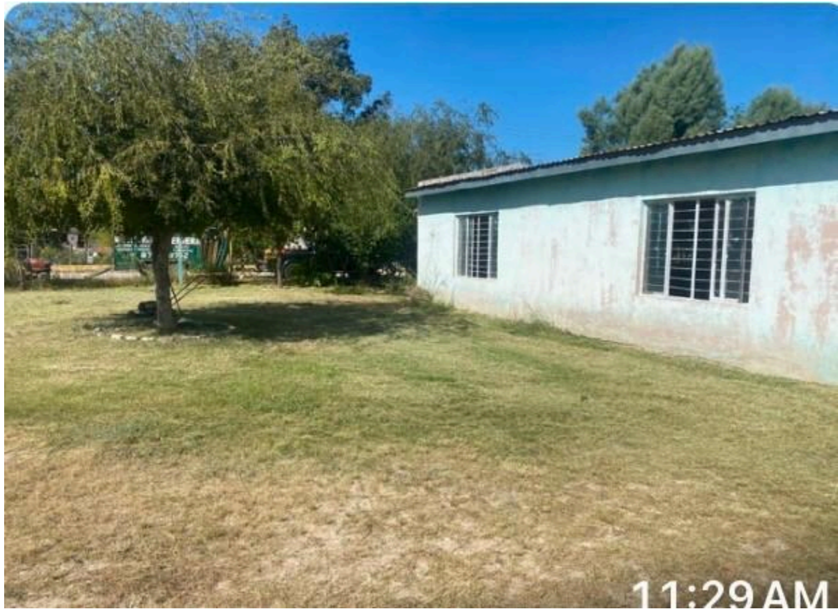
After lot was cleaned up