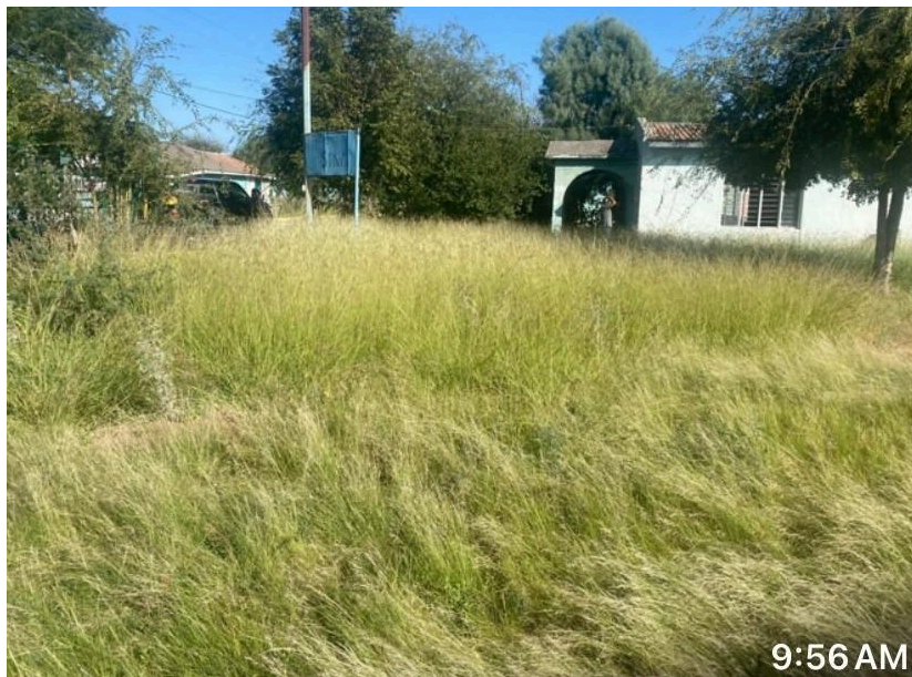
The “before” picture.