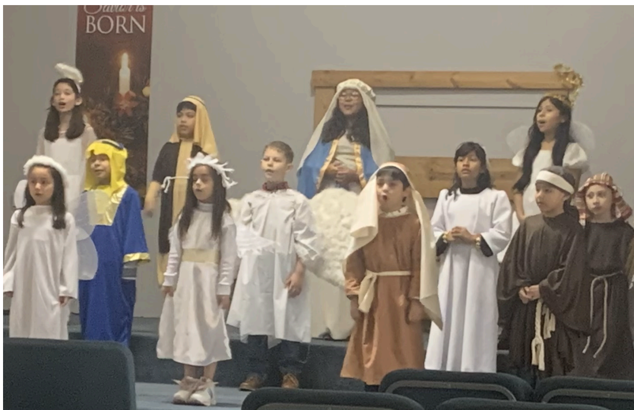
Christmas party Pictures 3, 4 and 5