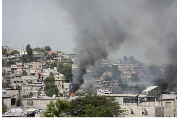
Continued turmoil in Haiti Capitol!